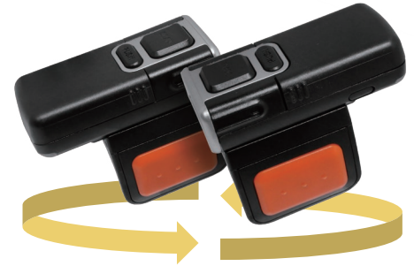
AMBIDEXTRIOUS RING TRIGGER

For the further inquiry, please contact: service@pointmobile.com