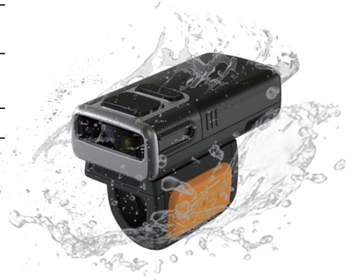
IP65 WATER/DUST RESISTANCE