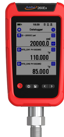
Additel 260EX with ADT158Ex module