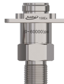
"ADT158Ex pressure module - for use with ADT260Ex (bottom mount)"