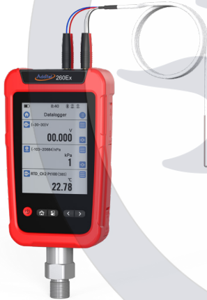
ADT260Ex with AM1602 temperature probe

Note: The ADT260Ex can be purchased without the ADT158Ex module If needed using the following part number: ADT260EX-NO