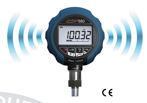
680 with data logging and wireless (optional)